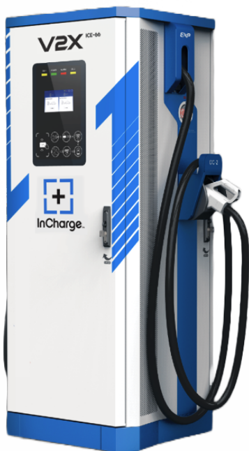
ICE-66 V2X DC Fast charger (66kW, dual dispenser)

Encompassing V2G (Vehicle-to-Grid) and other technologies (see Key Applications of V2X, below right), V2X chargers offer a robust application of this technology, offering benefits that include: greater flexibility for energy use, more balanced energy demand, and to support renewable energy sources, while reducing grid strain. By allowing EVs to feed energy back to the grid or supply power to homes and businesses, V2X helps balance energy demand, reduce grid strain, and support renewable energy sources. V2X technology also provides cost savings by enabling energy storage to be used at times when prices are lower and to be stored or discharged to the grid or other systems during times of peak demand. V2X also offers backup power during outages, ensuring homes or businesses can remain operational even when the grid goes down.